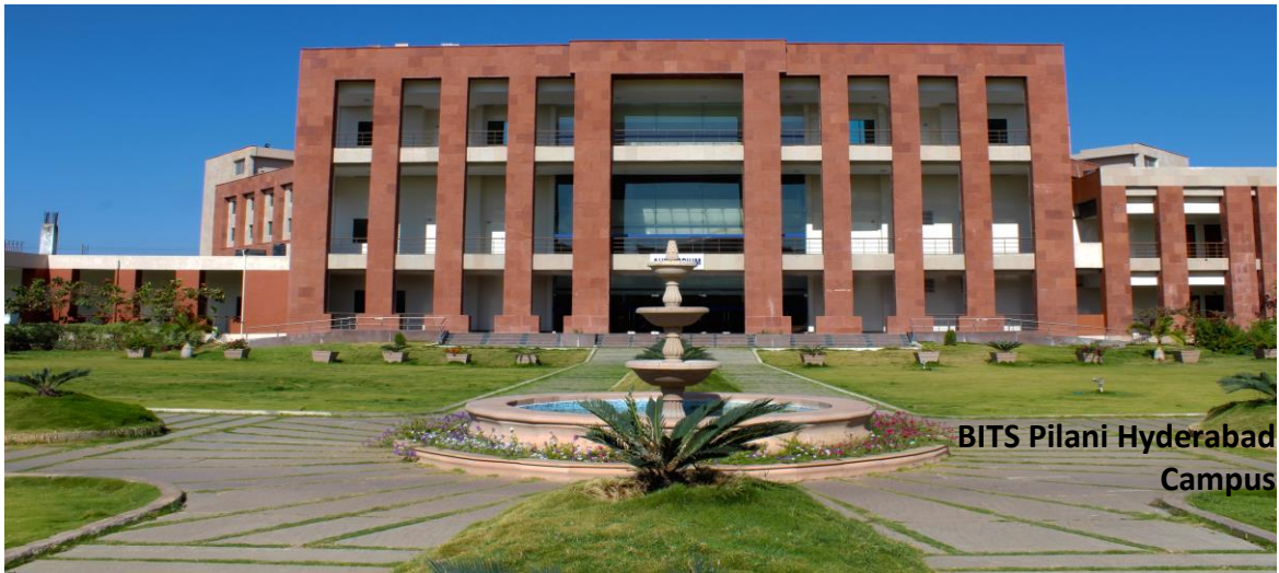
BITS Pilani Hyderabad Campus