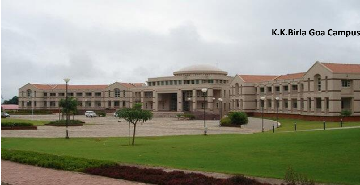
K.K.Birla Goa Campus