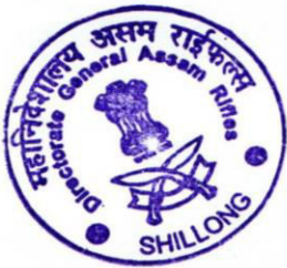
Major/Dy Comdt SO - 2 (Rect) Rect Branch Directorate General Assam Rifles Shillong-793010