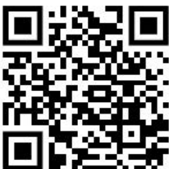
QR for STET-19 form

01:30PM to 4.00 PM for (Primary Teacher)