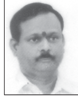
సంచాలకులు తెలంగాణ సార్వత్రిక విద్యాపీఠం హైదరాబాద్,