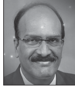
కార్యదర్శి విద్యాశాఖ తెలంగాణ ప్రభుత్వం హైదరాబాద్