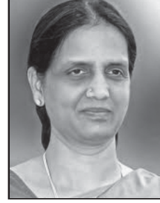
విద్యాశాఖామాత్యులు, తెలంగాణ రాష్ట్ర ప్రభుత్వం హైదరాబాద్.