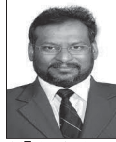
కమీషనర్ మరియు సంచాలకులు పాఠశాల విద్య, తెలంగాణ ప్రభుత్వం, హైదరాబాదు.