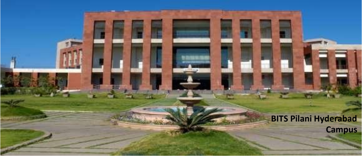
BITS Pilani Hyderabad Campus