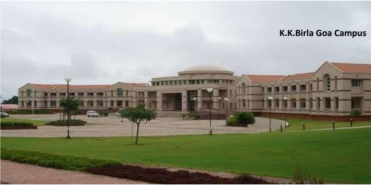
K.K.Birla Goa Campus